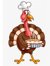
Table of Grace Thanksgiving Meals

It's right around the corner and it's time to start collecting food items. We need: